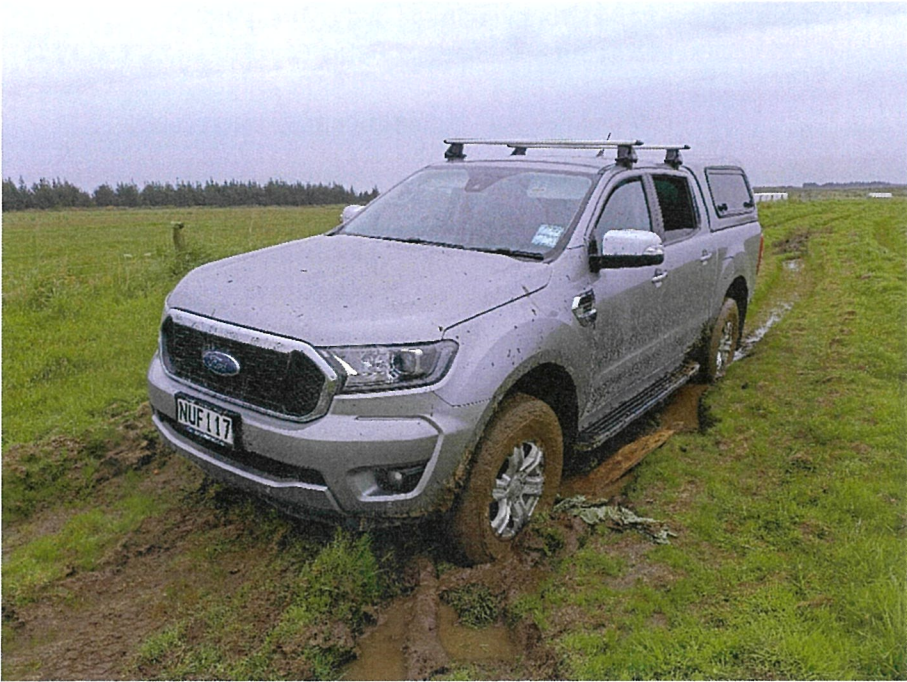
Caption: "Just waiting for a mate"

Staff have surveyed a wetland at Waimatua, which will be constructed once the site dries out.