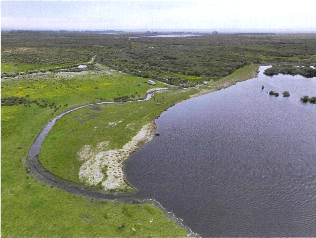
Caption: The dam and outlet. Note the trench in the outlet, which lowered the water level sufficiently for planting at the waterline. The wetland will be raised again in a year or so.