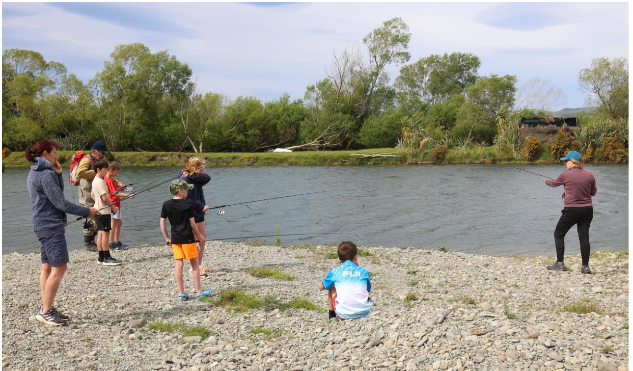
Fishing fun during the Central Southland Fishing Day