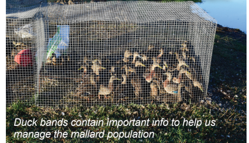
Duck bands contain important info to help us manage the mallard population

Want to do your part to help us manage and improve the mallard population? Then get the details of any banded birds you've harvested back to us.