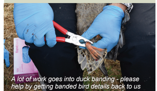
A lot of work goes into duck banding - please help by getting banded bird details back to us

We know hunters like to keep bands as a memento or 'trophy' – that's fine, we just want to get some basic info off you such as where and when you shot the bird carrying that precious metal. Call us on (06)359 0409.