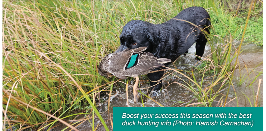
Boost your success this season with the best duck hunting info

Getting the best intelligence and information to plan your hunting trips can certainly improve your success over the season.