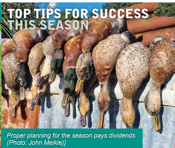
Proper planning for the season pays dividends