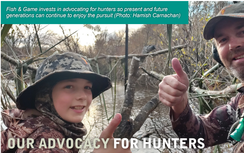
Fish & Game invests in advocating for hunters so present and future generations can continue to enjoy the pursuit