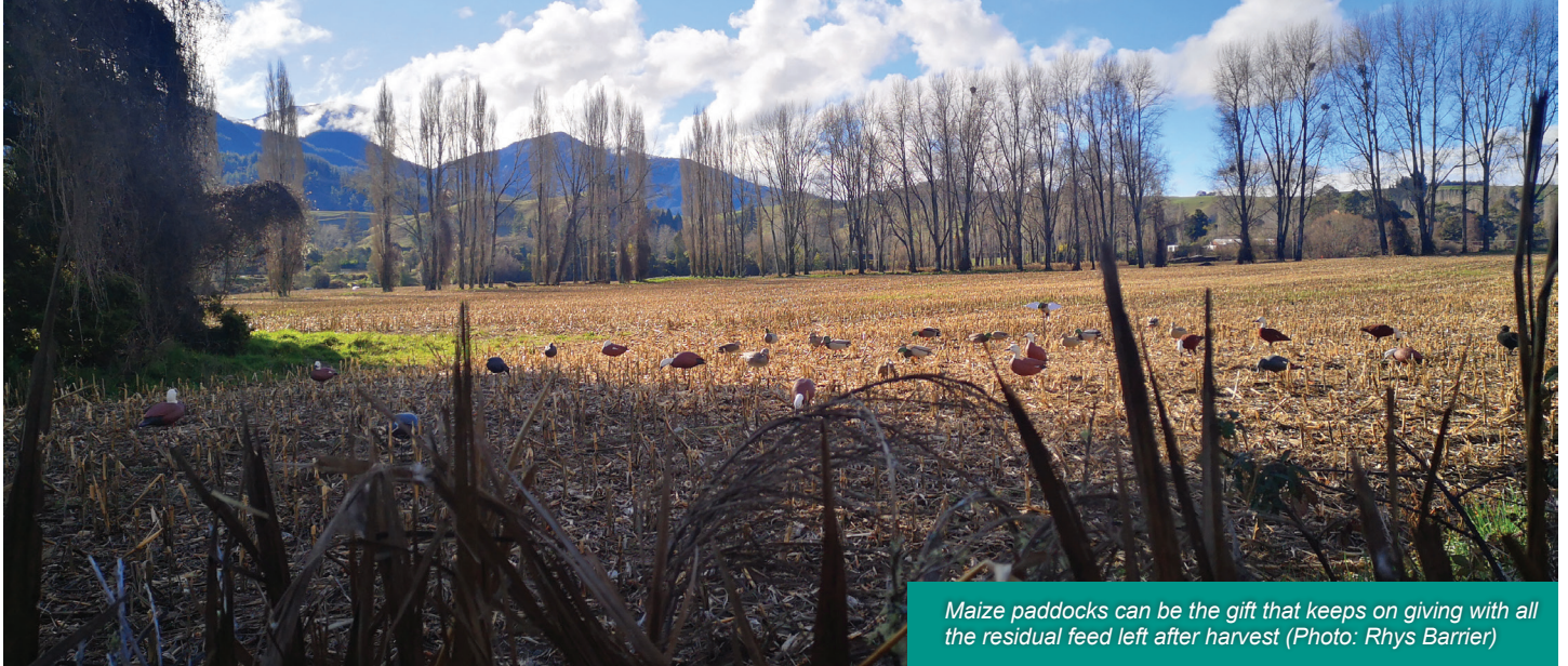
Maize paddocks can be the gift that keeps on giving with all the residual feed left after harvest

Last season demonstrated the value of factoring feed into your hunting plans – those who actively fed out their hunting spots from the start of April, even within public hunting areas others find difficult to access, generally did really well on Opening Weekend and throughout the rest of the season.