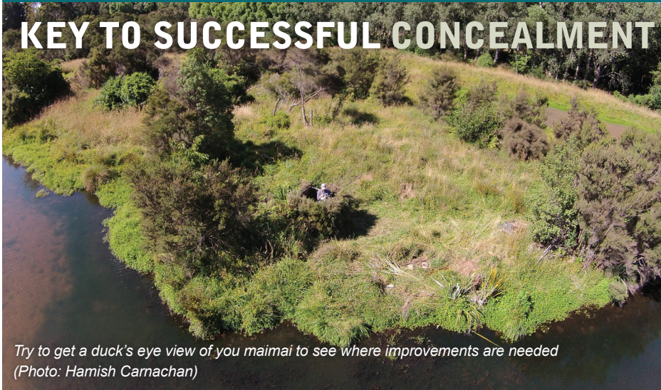
Try to get a duck's eye view of you maimai to see where improvements are needed

A beautiful day of clear sky and no wind last summer saw staff from Wellington Fish & Game board a Cessna and take to the air for our annual paradise shelduck counts.