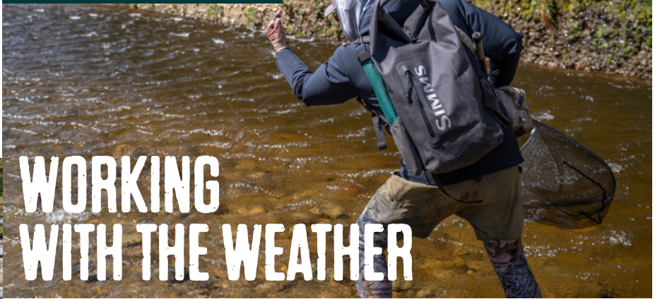
Spring weather frustration with winds gusting 100kmh on a Wellington stream.

Lake Rataipiko supports a productive fishery for brown and rainbow trout and perch, with some fish reaching 3.5kg. Lowering the lake level every year has disrupted the aquatic habitat and the food supply for fish. While Manawa Energy is adamant it needs to lower the lake level every year to allow inspection of the inlet race, Fish & Game will continue to advocate for a better outcome for the aquatic life in the lake.