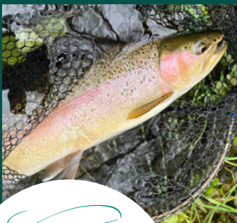
A beautiful early-season rainbow from a small southern Hawke's Bay stream

There are plenty of exciting angling options available less than an hour's drive from Palmerston North. Check out our interactive access maps (scan the QR code) or spend a little time exploring any of the waterways you cross on SH2 – you might be surprised by the fishing gems you find!