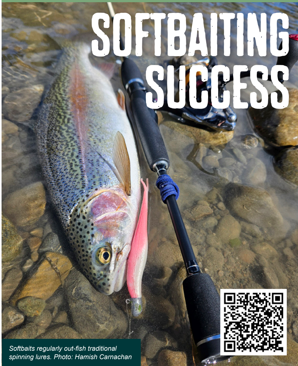
Softbaits regularly out-fish traditional spinning lures.