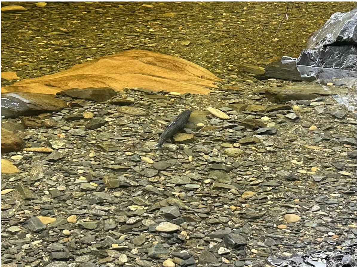
A salmon spawning in MacDonalds Creek, Lake Mapourika, May 2025.