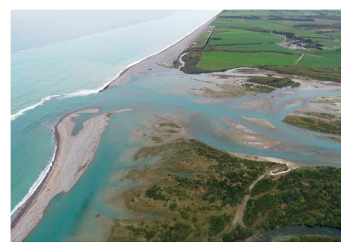
Aerial view of the rivermouth

The lagoon area and mouth are worth a cast for resident and sea-run brown trout that key into the prey fish species that live in the area.