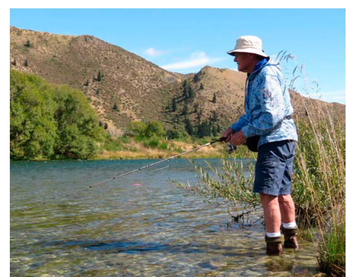
Spin fishing the stable waters at Kurow

The Waitaki River is famous for being the birthplace of salmon fishing in New Zealand. A hatchery located on a small creek of the Hakataramea River, a major tributary of the Waitaki, produced the first recorded salmon run in New Zealand in 1905. The salmon fishery is now a shadow of its former glory but still attracts a dedicated following of anglers each season.