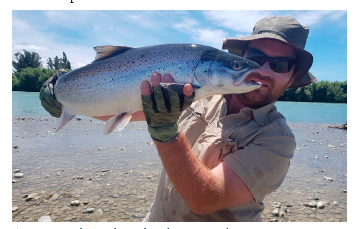
An exceptional Waitaki catch - a large searun brown trout

Both trout and salmon anglers who access the river by jet boat have a major advantage over the shoreline angler as they can access kilometres of braids and pools that are inaccessible by foot. The only fully formed boat ramp on the river is located between the bridges at Kurow and is popular with jet boat anglers, especially on opening day of the new season. Other popular spots for launching jet boats includes Duntroon, Bells Pond intake and the Te Maiharoa Rd access points.