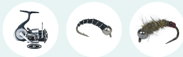
Reels should be good quality; nymphs with a bit of weight to get them deeper are better.

What's more, you can cover much more water with longer casts, and more drifts, than traditional fly fishing because there is no need for false casting. Top it off with the fact that you can cast in wind that would have a fly fisher with their head in their hands and you have an incredibly versatile and effective fish-catching method that works equally as well in backcountry or lowland surrounds.