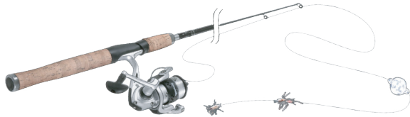
Threading set up with dry flies - note the position of the bubble float at the end of the line.

The method is also exceptional when caddis and sedge flies are hatching en masse. Cast across and allow the flies to swing as they move downstream; at the same time control the height of the imitations with the rod tip to create a skating effect that mirrors the action of the naturals. Large terrestrial patterns can also be used effectively by casting upstream to sighted trout or through likely lies and allowed to drift back in the current without drag. Think cicada season or when hoppers are about. Stay in touch with the flies by winding in any slack line at the same speed as the current, not faster, so you can strike when a trout takes. High-visibility braid as the main running line can help.