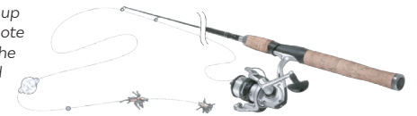
Threadlining set up with nymphs - note the position of the bubble float and the split shot.

Trout aren't evenly distributed in a river - they prefer to hold in specific places.