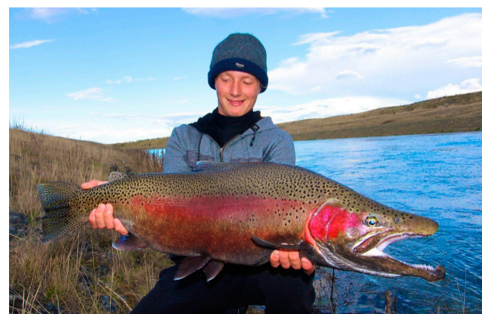
A rainbow trout caught from the Ōhau A Canal

The Tekapo, Pūkaki and Ōhau canals were constructed in the 1970s and 1980s and now form an essential part of Aotearoa's/New Zealand's Renewable energy fleet. Meridian Energy and Genesis Energy now own and operate their respective power stations across the Mackenzie and Waitaki. Access to the canals for fishing has been made possible by them and all users should ensure they respect the rules and fishing etiquette.