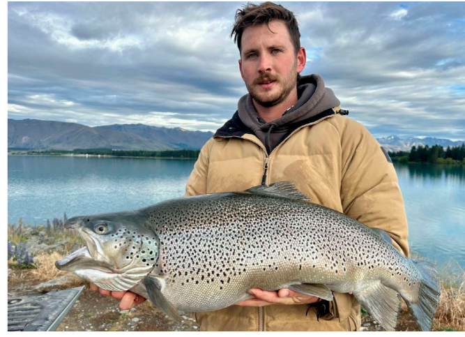
A 14.5kg Brown trout caught from the Ōhau B Canal