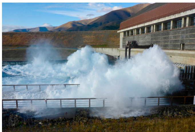
Barriers and signage are erected to keep you out dangerous places like this emergency discharge area pictured

Camping – no camping is permitted on the canals. Camping includes camper vans, motor homes, and sleeping in your car. This rule is enforced, and campers will be required to move-on based on the assessment: “if it looks like camping, it is camping”. Accommodation and camping is available throughout the Mackenzie, especially in the townships of Tekapo and Twizel.