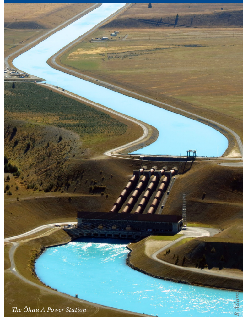
The Ōhau A Power Station