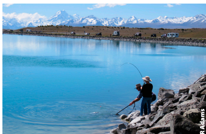
A summers day at the Tekapo Canal

The water clarity in the canals varies from crystal clear to a silty glacial blue-green or grey. Sight fishing is possible during the clear times. In clear water, fishing with as light line as possible will be an advantage as will fishing during low light