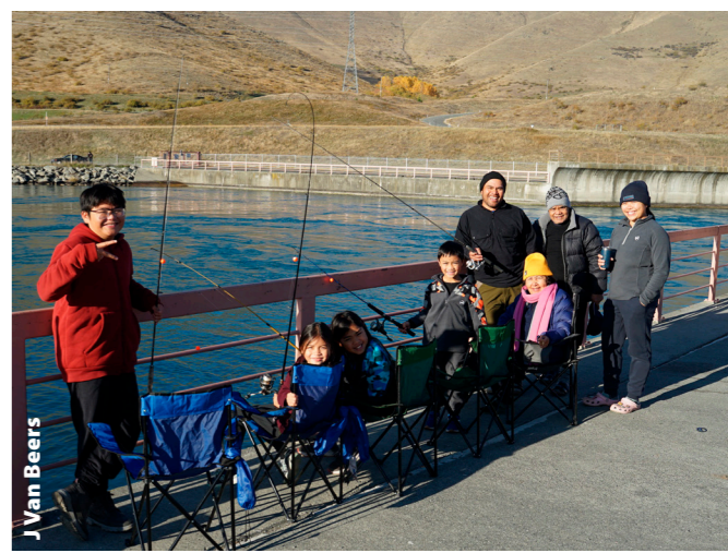
Easy access and safe fishing for all to enjoy

Tekapo Canal closed to fishing from 1st Jun - 31 Aug between bridge and 5.