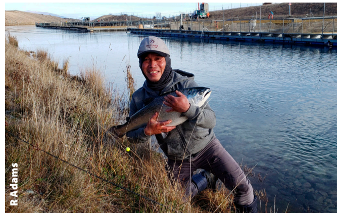
If taking home a salmon for dinner is your goal - focus your efforts near the salmon farm pens

There are a few things to keep in mind when fishing the canals to keep your visit enjoyable and ensure that the opportunity to fish around the hydro stations and canals, which are privately owned and operated, is maintained for future generations of anglers. The Tekapo Canal is owned by Genesis Energy while the Pūkaki and Ōhau canal chain is owned by Meridian Energy.