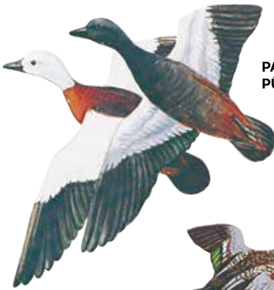
PARADISE SHELDUCK/ PŪTAKITAKI