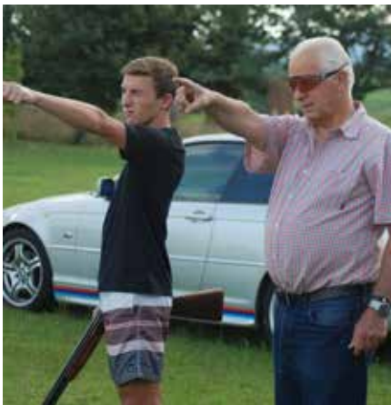
Figure 1. First determine what is your dominant eye. The dominant eye is the eye you sight down the shotgun - if you shoot right handed you want your right eye to be dominant and vice versa. Point at an object in the distance with both eyes open, then close the left and then the right. With the dominant eye open your finger will remain pointing at the object. When the non-dominant eye is open your finger will no longer be pointing at the object. If you start missing targets check that your dominant eye hasn't changed - it happened to me. I got around this by keeping my right eye closed (I shoot left handed) for a while and it eventually swapped back.