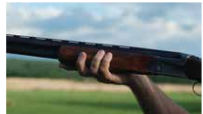
Figure 7. Hold the fore stock like holding an egg - not too hard. Some hunters like to point towards the target with their index finger.