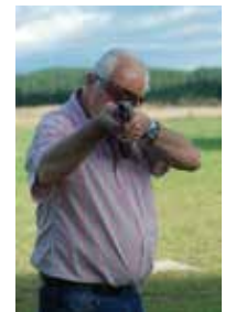
Figure 6. Wrong - eyes are not level