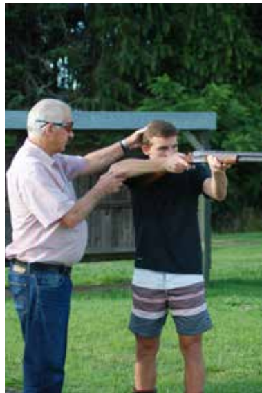
Figure 4. Tuck into the gun. With the combination of putting your weight slightly forward and keeping your eyes level your head will move forward slightly.