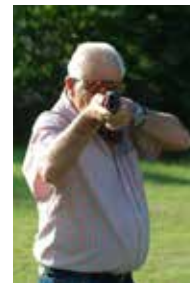
Figure 5. Correct - eyes level.