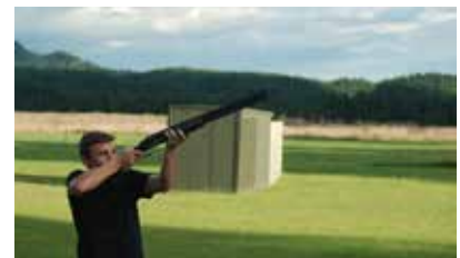
Figure 8. Swing from knees and hips. If you swing from the arms you stop swinging. Make sure you follow through.