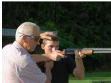
Figure 3. Head level. Keep your eyes level.